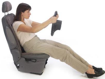
Slumped with knees straight

5. Try moving your car seat slightly forward. When your knees are too straight, the tendency will be for your bottom to slip forward on the seat and cause you to slump.