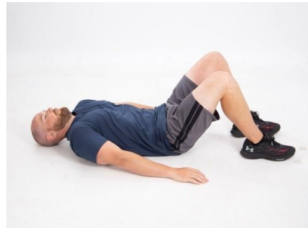
(Tight Pec Minor)