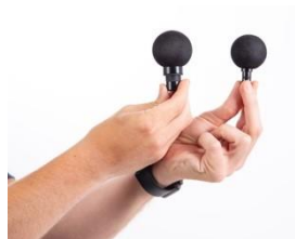
(Big & Small Round Head)